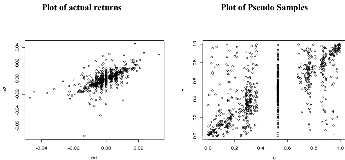
Figure 2. Scatter Plots

These values together with the values of dependence parameters are presented in Table 3. On the basis of information criteria, t copula gives the best fit followed by Gumbel, Frank, Gaussian and Clayton. t copula as shown in Figure 3, is capable of modeling the tail dependence.