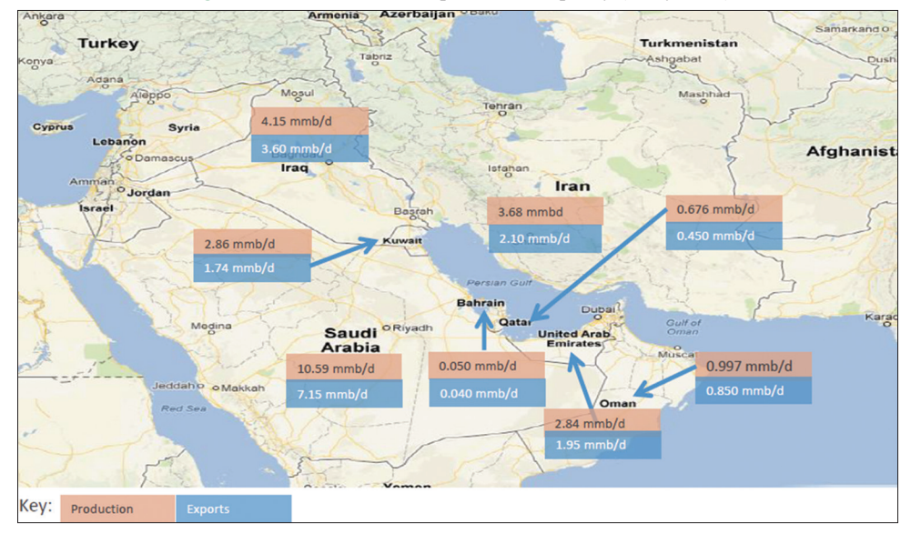
Figure 1: The Gulf states oil production capacity (Barry 2016)

various channels, including journals, conference papers, policies, and books. Figure 2 illustrates the structural approach employed in analyzing data, following the guidelines outlined by Demiris et al. (2019).